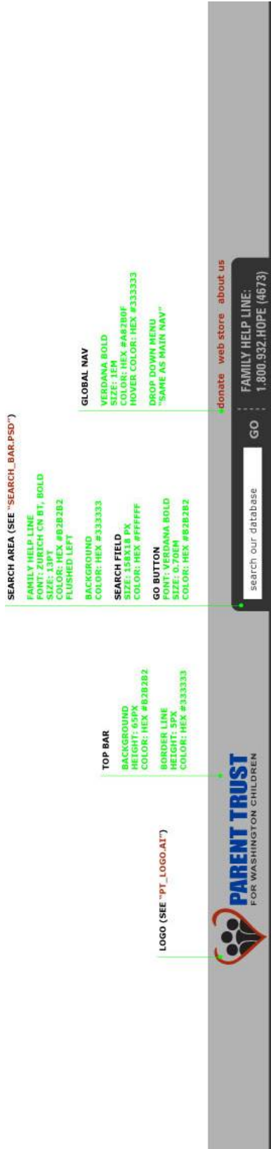
Homepage Specs, above.