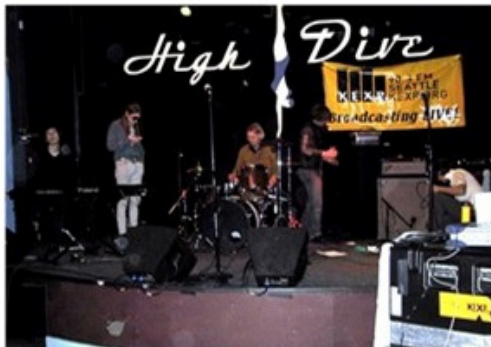
Holy Ghost Revival warms up.